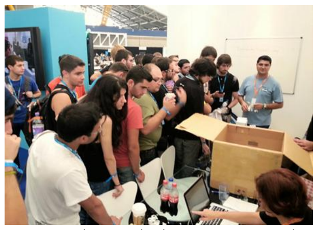
Huge interest by young developers at FI-WARE stand

The FI-WARE team expects that this is just the beginning and that many more developers will engage in using FI-LAB. The soundness of the technical concept and the amazing opportunities enabled by the technology available in FI-LAB convinced the audience at the Campus Party.