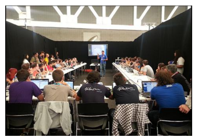
FI-WARE technical workshops were always crowded: 180 attendees put their hands on the technology

The 2013 edition of the Campus Party has been one of the biggest and best ever, attracting some 10,000 participants ("Campuseros") over the four days. Some figures to highlight the size of this huge event: 3,500 campers from 40 countries around the world, 250 speakers, over 500 hours of content and 16 sponsors, including, Sony, Microsoft, Barclays, Ladbrokes, Facebook, the European Union and UK Government, as well as 35 companies represented at the MarketPlace plus 50 of the brightest new European start-ups. FI-LAB received the high level of visibility it deserved.